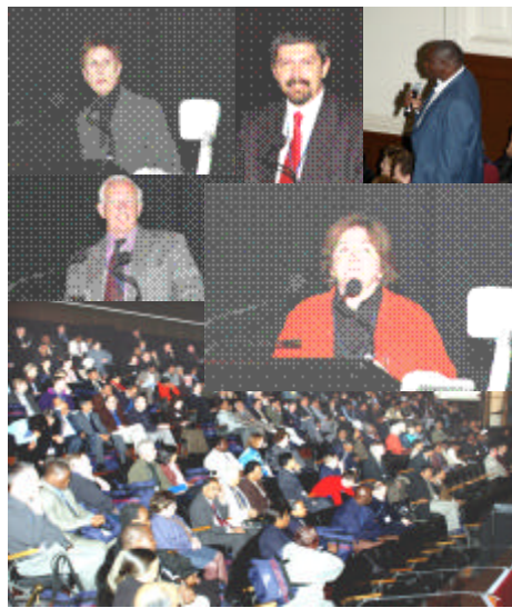
A time for questions and the Convenors report back at the end of day one

The COL Excellence in Distance Education Awards banquet rounded off Tuesday very nicely. Lots of people and institutions received awards including Open Polytechnic which “has, within the relatively short period since its inception in its present form in 1990, established itself as one of New Zealand’s leading providers of vocational lifelong learning.” See http://www.col.org/idea/ for more detail.