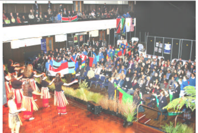
The opening ceremony and entry of the Commonwealth flags