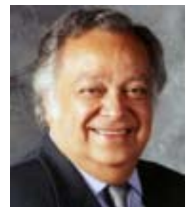
Sir Shridath ("Sonny") Ramphal

Sir Shridath is an advocate of Third World solidarity and an ardent supporter of the United Nations and Commonwealth systems.