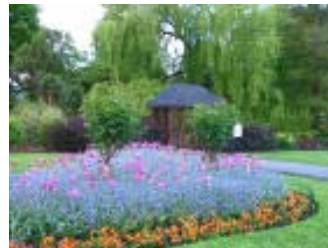
Botanic Gardens Dunedin

The only formal presentations will be by keynote speakers.